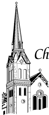
Church of St. Michael

Church of St. Michael 611 South 3rd Street Stillwater, MN 55082